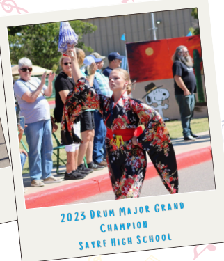
2023 2A DRUM MAJOR GRAND CHAMPION SAYRE HIGH SCHOOL