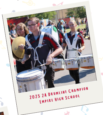
2023 2A DRUMLINE CHAMPION EMPIRE HIGH SCHOOL