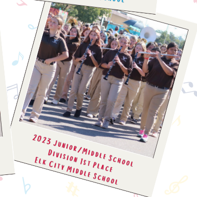
2023 JUNIOR/MIDDLE SCHOOL DIVISION 1ST PLACE ELK CITY MIDDLE SCHOOL