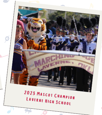
2023 MASCOT CHAMPION LAVERNE HIGH SCHOOL