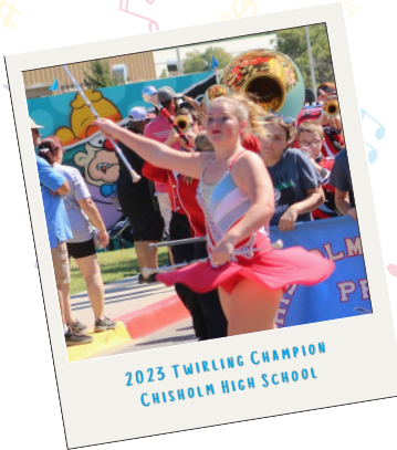
2023 TWIRLING CHAMPION CHISHOLM HIGH SCHOOL