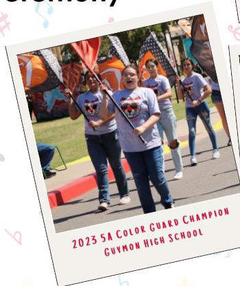
2023 5A COLOR GUARD CHAMPION GUYTON HIGH SCHOOL