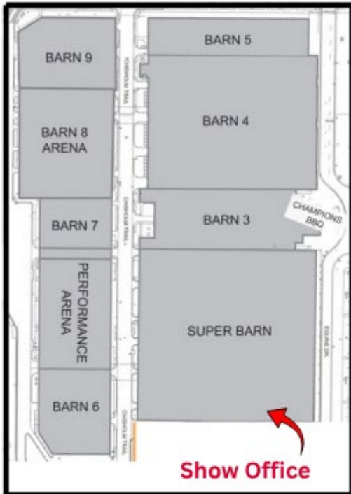
Barn Complex Aerial View